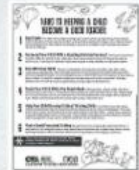
Parent handout "6 Keys" available in 8 languages