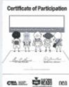
Certificates also available in Spanish

Download these resources at www.cta.org/californiareads .