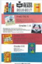
Poster with all 2016-2017 recommended books